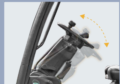
The ergonomically designed tilt-adjustable small-diameter steering wheel makes the driver feel good