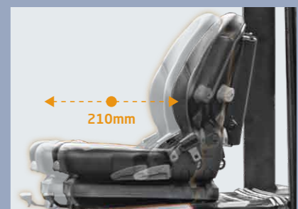
The seat can be adjusted back and forth by 210mm. The operator can choose the best driving position