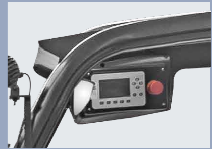
The dashboard in the driver's cab is placed overhead and can be seen when the driver lift her/his head, and the function buttons can be pressed easily