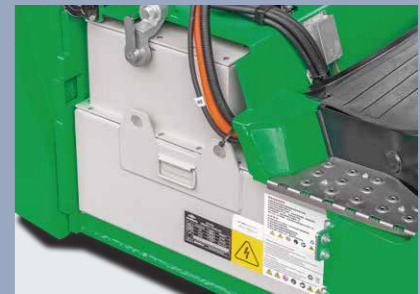
The packs can be easily removed by a manual or electric cart, and can be repaired and maintained conveniently