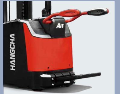
The integrated stamping molded guardrail offers better protection for the operator