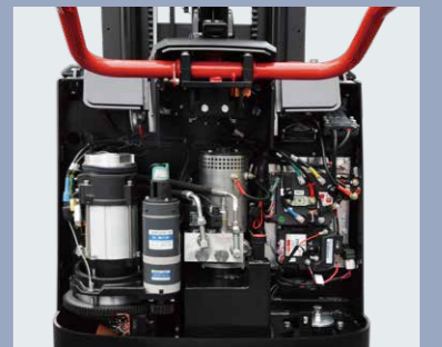
Back cover can be opened fully, and all components and parts are clear at a glance, which is very convenient for maintenance of the entire machine