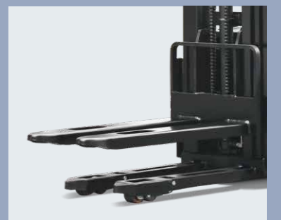
Tandem load wheel